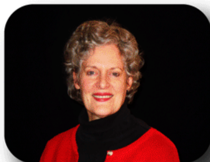
President, Double R Productions